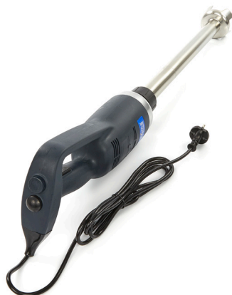
Lightweight and easy to operate