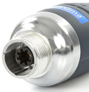
Removeable knife and inner shaft